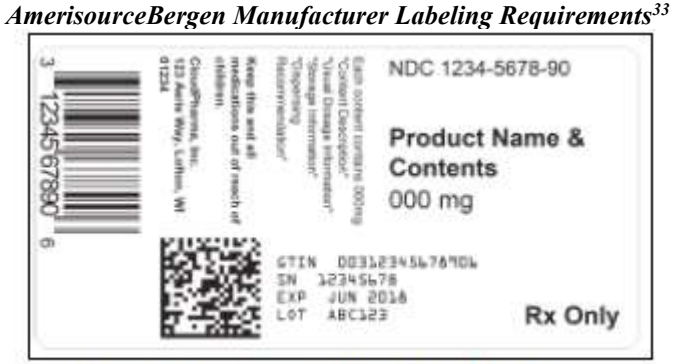
DSCSA RX Serialized Unit Label