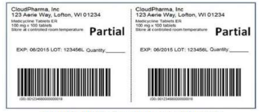
Example Partial Case Labeled with SSCC