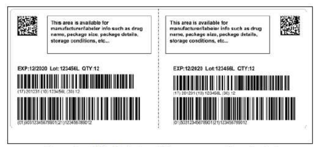
Example of Rx Serialized Homogenous Case Label